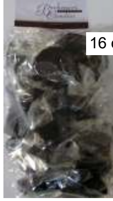
16 oz bag