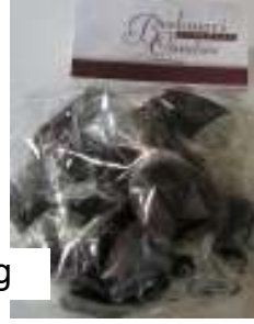
6 oz bag