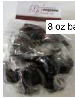
8 oz bag