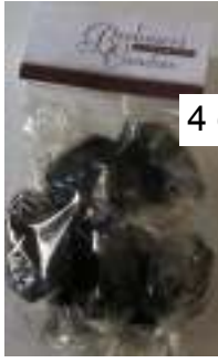
4 oz bag

Chocolate Caramels bursting with chocolate flavor. Made with heavy cream and butter for richness and flavored with molasses, cocoa powder, and real vanilla extract for rich chocolate chew.